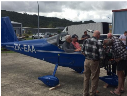
RV 12 ZK EAA on first engine run

MBAS build Trust has now wheeled out the current RV12 build for the first engine run.....looking good in its blue paint and recently applied registration markings and stripes